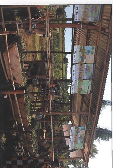
Rulindo Community event - Send a Cow Rwanda arranged what can only be described as a fantastic event in Rulindo District, where many hundreds of local villagers and farmers came together to show all they had learnt about sustainable farming from the Jersey Inka Nziza project