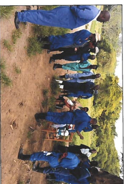
AI training at Songa Research Station